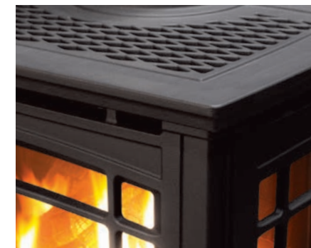
European castings - Painted Black