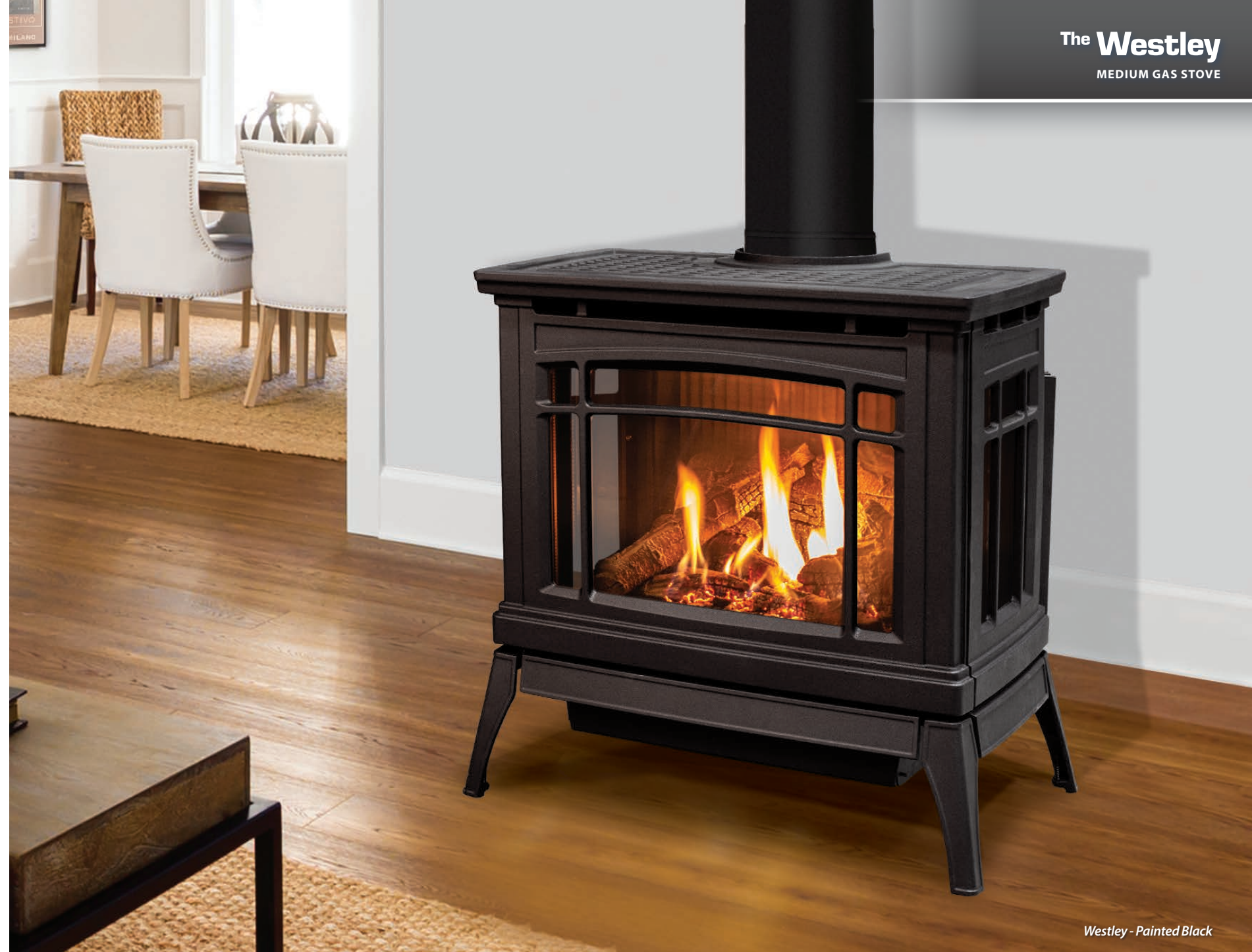
Westley - Painted Black