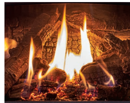
8 Piece ultra high definition log set