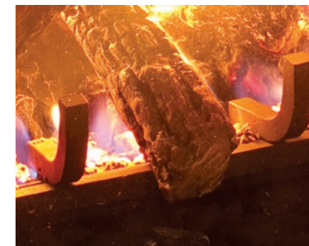
Steel fireplace grate