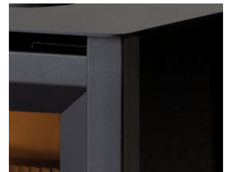
Modern steel construction