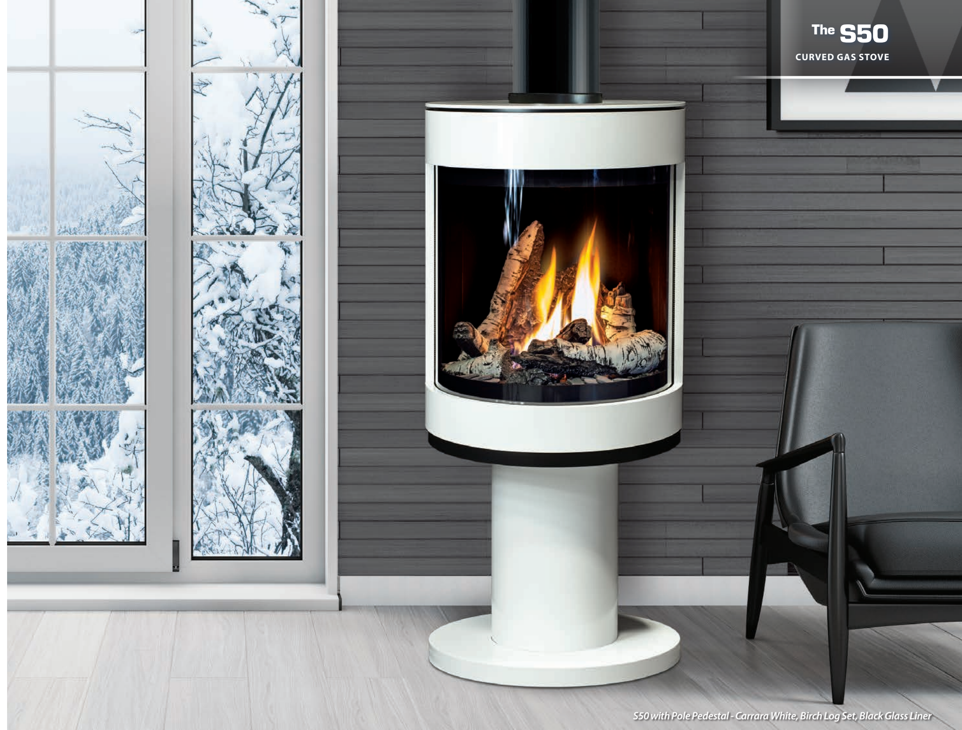
S50 with Pole Pedestal - Carrara White, Birch Log Set, Black Glass Liner