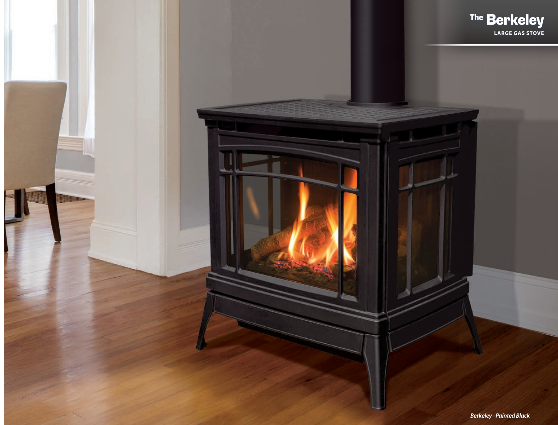
Berkeley - Painted Black