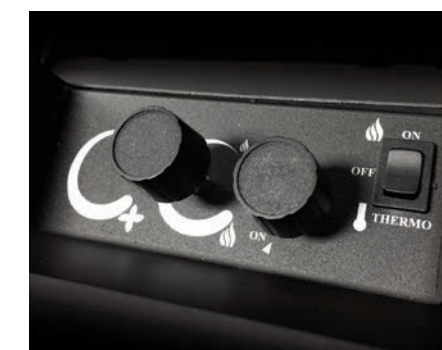
Easy access controls