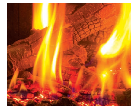
9 Piece ultra high definition log set