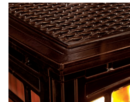
European castings - enameled antique chestnut