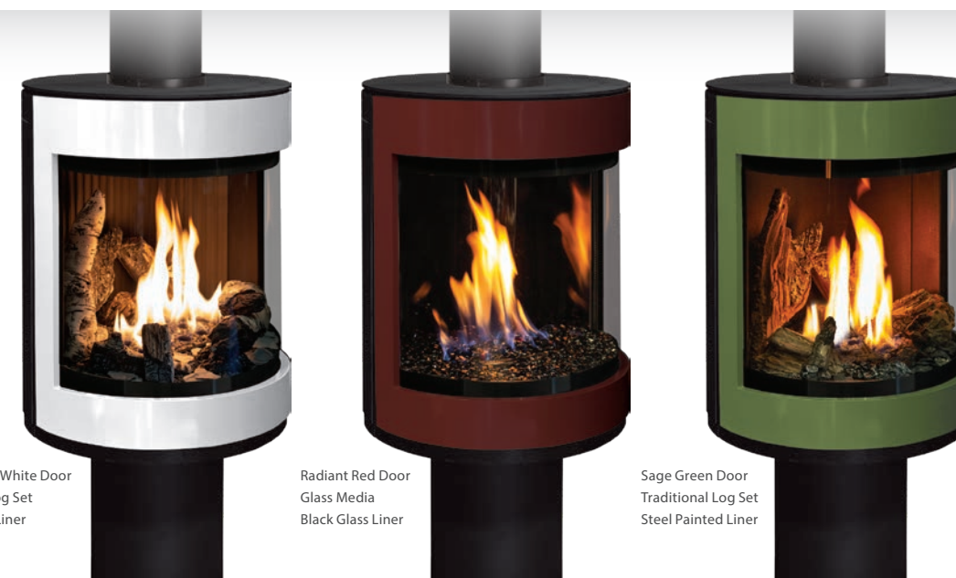
Carrara White Door Birch Log Set Fluted Liner