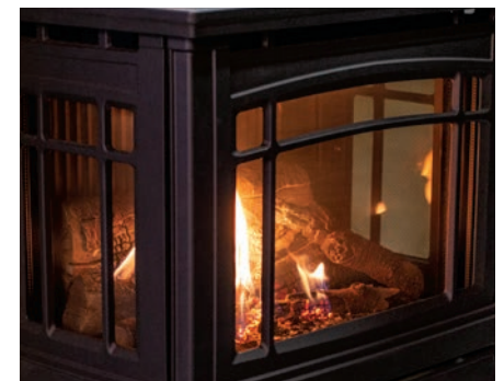
Flame visible from three sides