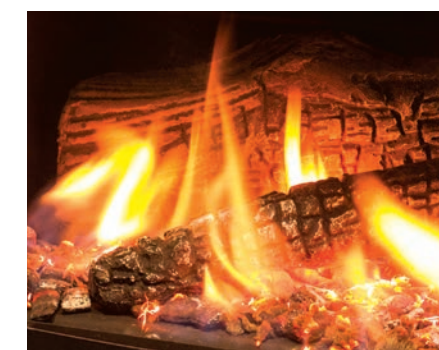
High definition log set