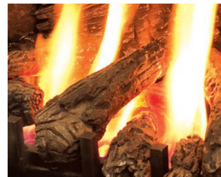
High definition log set