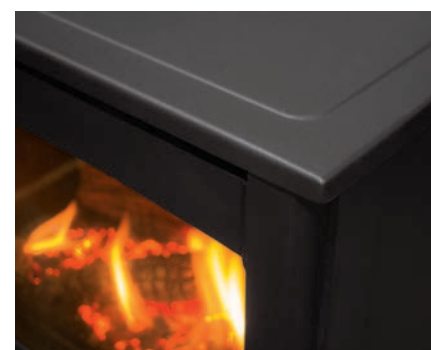
Formed steel outer construction