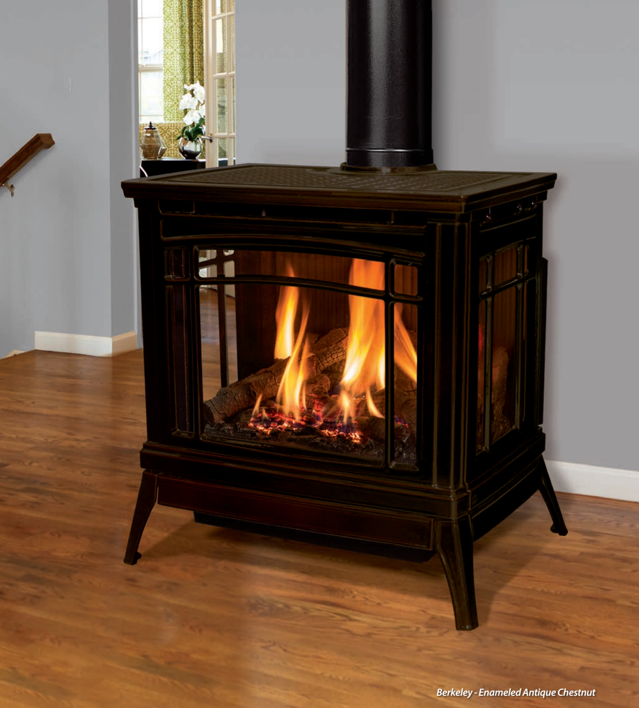
Berkeley - Enameled Antique Chestnut