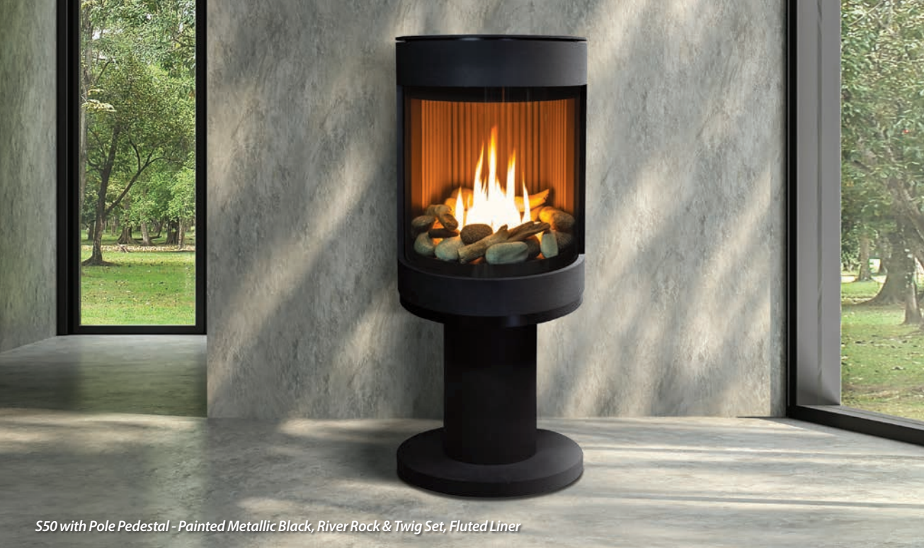
S50 with Pole Pedestal - Painted Metallic Black, River Rock & Twig Set, Fluted Liner