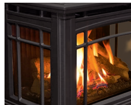
Flame visible from three sides

* Turn down is based on IPI valve with front burner being turned off.