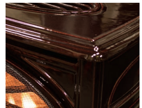
Enameled antique chestnut finish