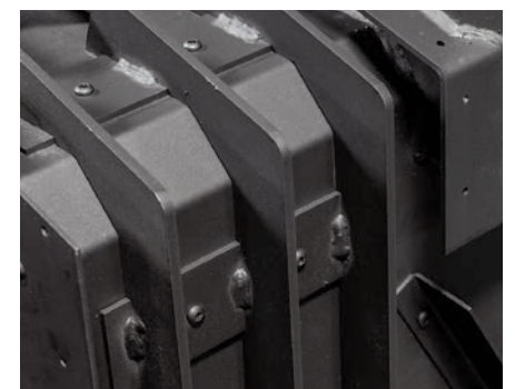
Heavy duty heat exchanger