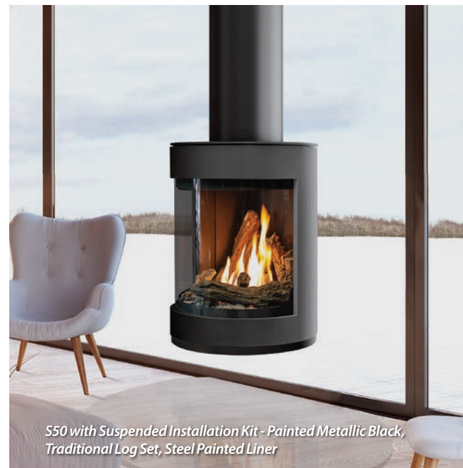
S50 with Suspended Installation Kit - Painted Metallic Black, Traditional Log Set, Steel Painted Liner