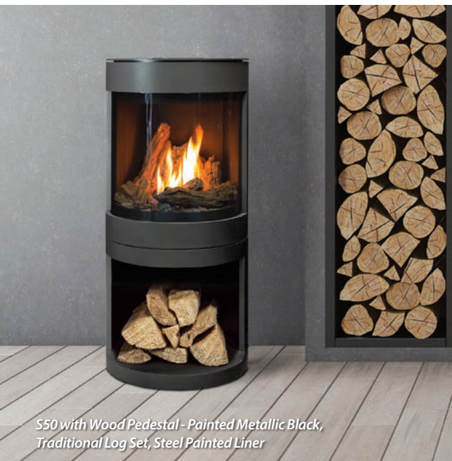
S50 with Wood Pedestal - Painted Metallic Black, Traditional Log Set, Steel Painted Liner