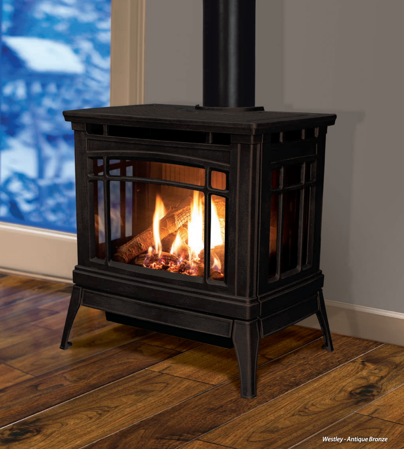
Westley - Antique Bronze