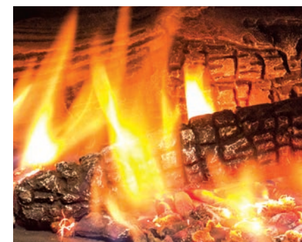
High definition log set