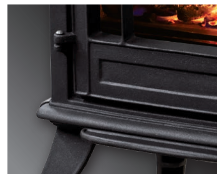
Cast iron doors